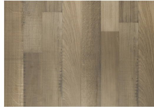
Maroon Bells MGLA0205