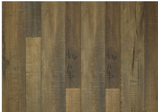
Rocky Mountain MGLA0202